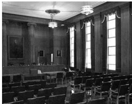
NC Supreme Court Chamber